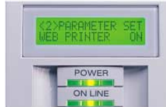
▲ Line backlit display