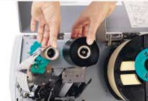
▲ Time-saving and minimal training due to fast and easy handling